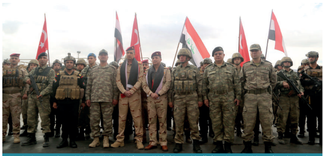
Meeting between General Othman Al-Ghanimi, former Chief of General Staff of Iraq (current Minister of Interior), and General Ismail Metin, Turkey's Second Army Commander. The meeting took place during the joint military exercise between the Iraqi army and the Turkish army on the Turkish side of the Turkey-Iraq borders during the period of the KRG referendum crisis in September 2017.