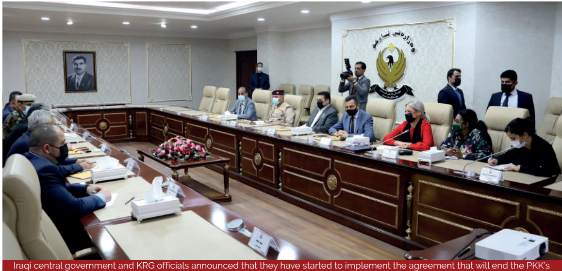
Iragi central government and KRG officials announced that they have started to implement the agreement that will end the PKK' presence in Mosul's Sinjar district.

32-seat Sulaymaniyah Provincial Assembly.<sup>19</sup> The PUK and the Gorran Movement have difficulties in making decisions at the local level because of the veto power of the federative government, despite having a majority of 23 out of 32 seats to pass decisions in the provincial assembly.