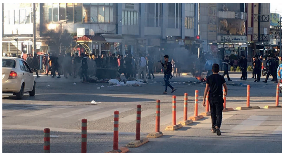
After the loss of life in the demonstrations in Sulaymaniyah, the demonstrators burned tires and closed the roads

The tensions between KRG provinces as well as their political parties also cause division between the Kurdish parties in central politics. The Gorran Movement positions itself against the KDP and the PUK in Baghdad, although it is involved in the KRG government, and even acts in partnership with the New Generation Movement which consists of the opposition parties in the KRG. On the other hand, the KDP and the PUK, although being closely positioned in Baghdad in terms of discourse, do not hold back from openly taking positions against each other, based on their